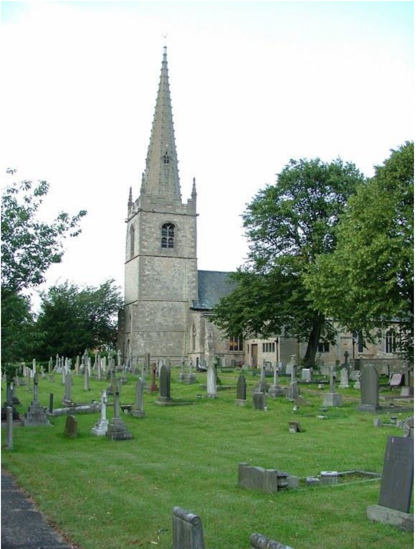
St. Giles Churchyard, Balderton