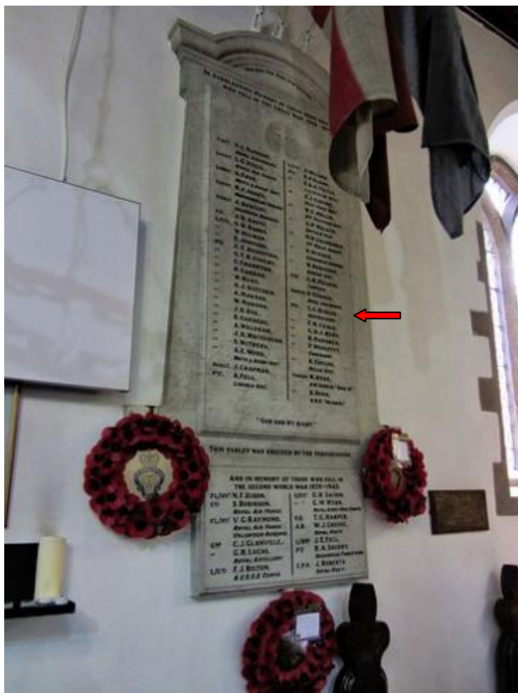
St. Giles Balderton Roll of Honour

Pte C. C. Burgin is remembered on the St. Giles Balderton Roll of Honour, located inside St. Giles Church, Balderton.