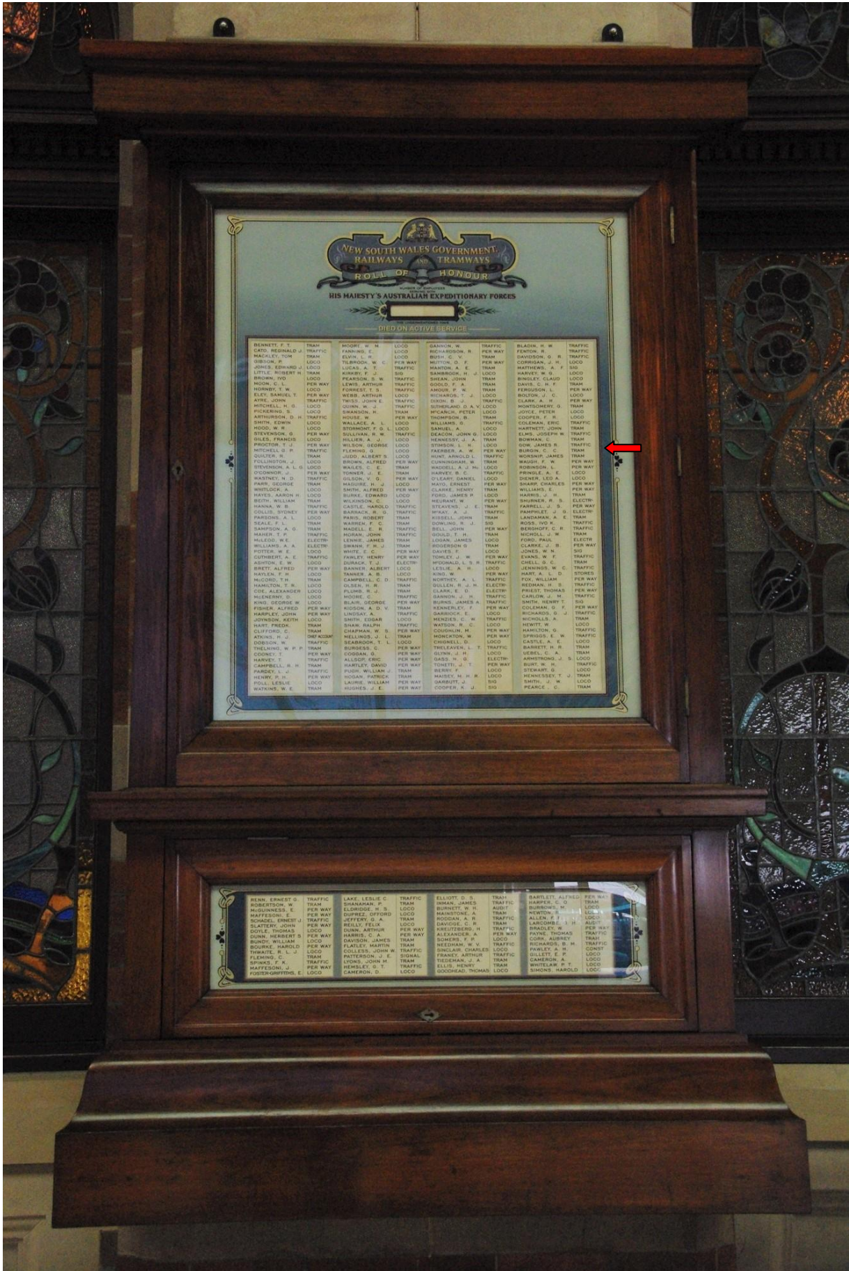
NSW Government Railways & Tramways Roll of Honour