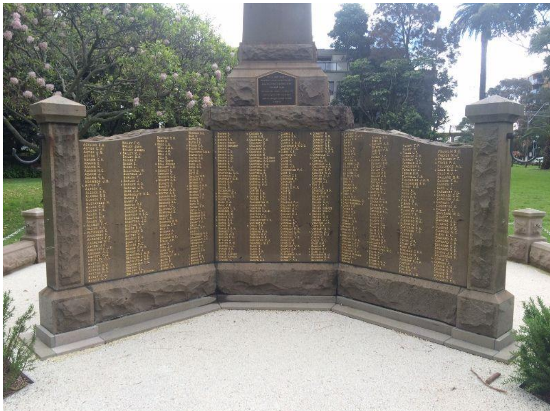
A - F Panels