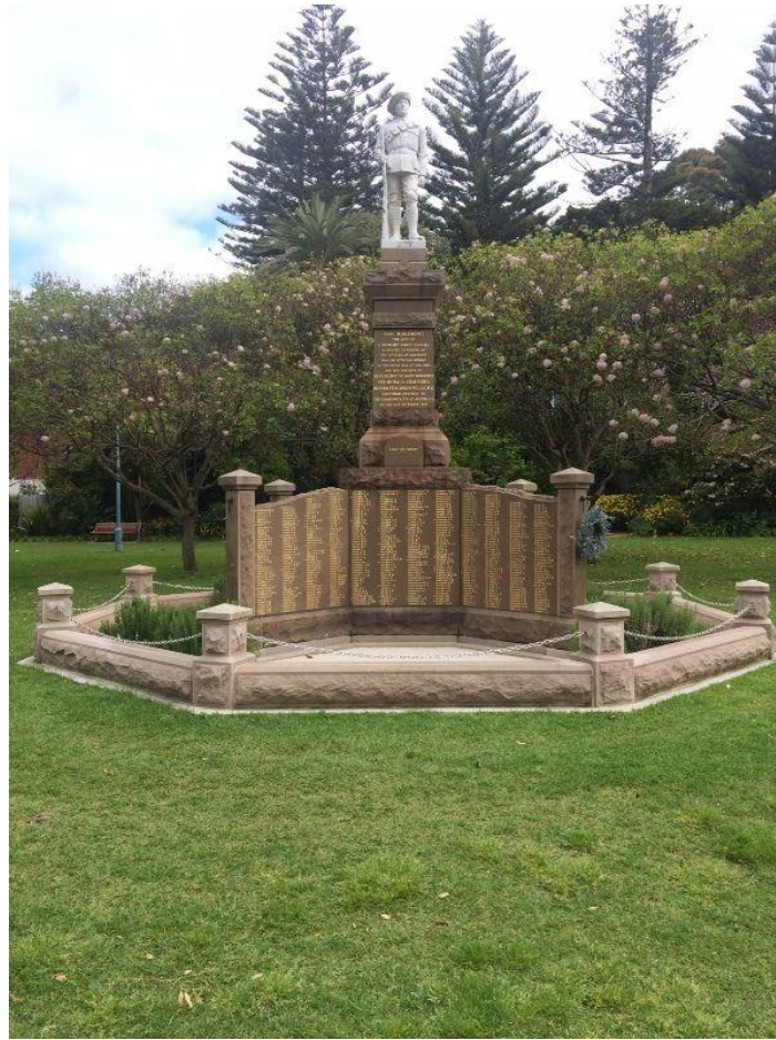
Waverley Soldiers' Memorial